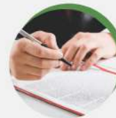
Clear Title Document