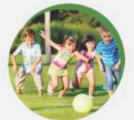
Park & Play Area