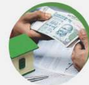
Bank Loan Available