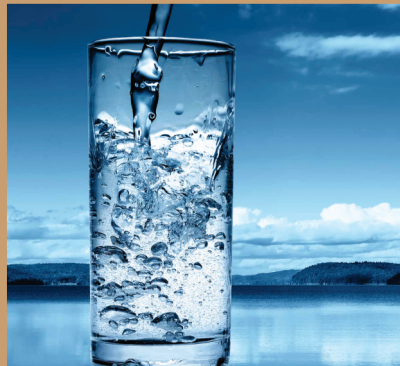
Sweet Potable Water 24X7 Water Facility