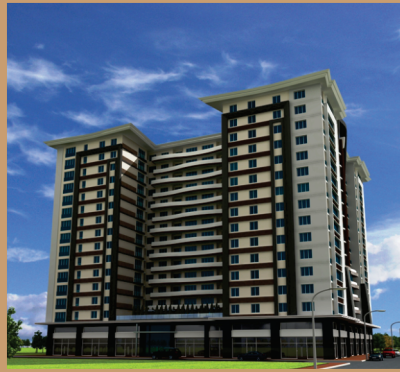
Uniworld Apartments Xs Real Apartments Ananya Apartments