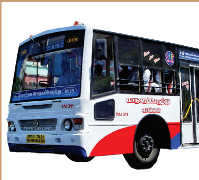
24X7 Bus Facility