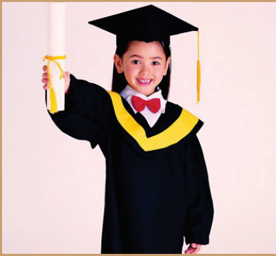
Delhi Public School